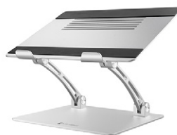
Adjustable Laptop Stand (PS0106EA1STA)