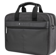
Dynabook Laptop Toploader 14" (PX2007E-1NCA)