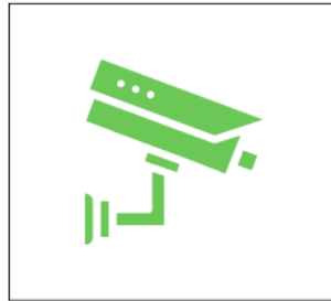
Risk management & security measures