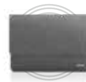
Lenovo Ultra Slim Sleeve