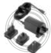
Lenovo 65W USB-C AC Travel Adapter