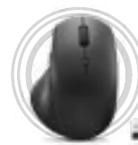
Lenovo 600 Bluetooth® Silent Mouse