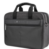
Dynabook Laptop Toploader 14" (PX2007E-1NCA)